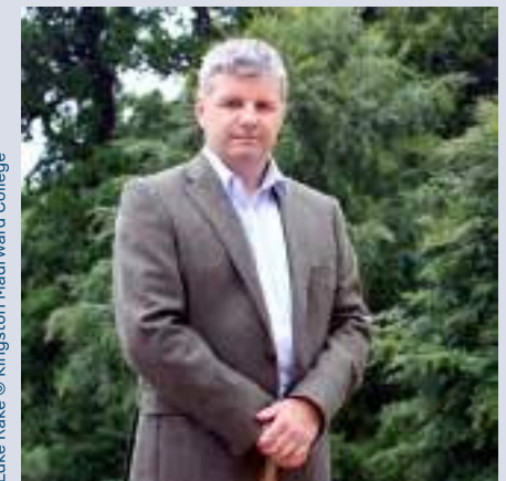
Luke Rake © Kingston Maurward College