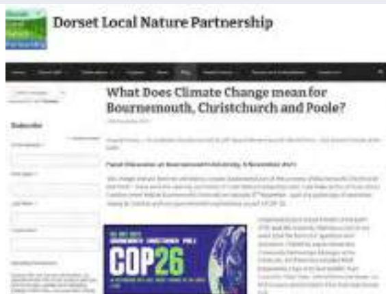
Above: LNP Blog

The LNP's communication tools help promote the work of the LNP and it's partners.