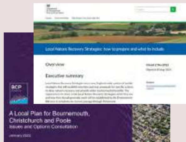
Above: Consultations documents

Responding to local and national consultations promotes the LNP's views and aims to shape policies and decision making.