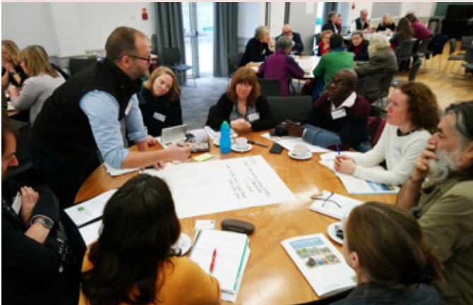
Above: Annual forum

The presentations and an event report are available at: www.dorsetlnp.org.uk/annual-forum-2020