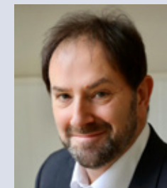
Simon Cripps