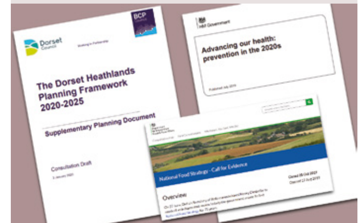
Above: Heathland Planning Framework, Food Strategy, Prevention 2020s