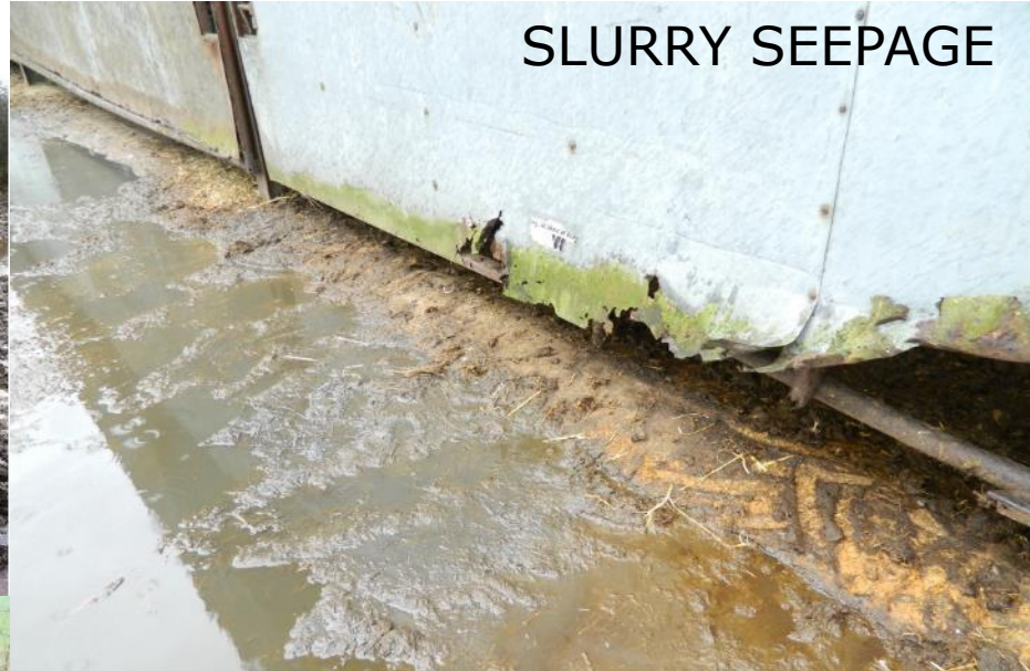
CLEAN & DIRTY WATER MIXING