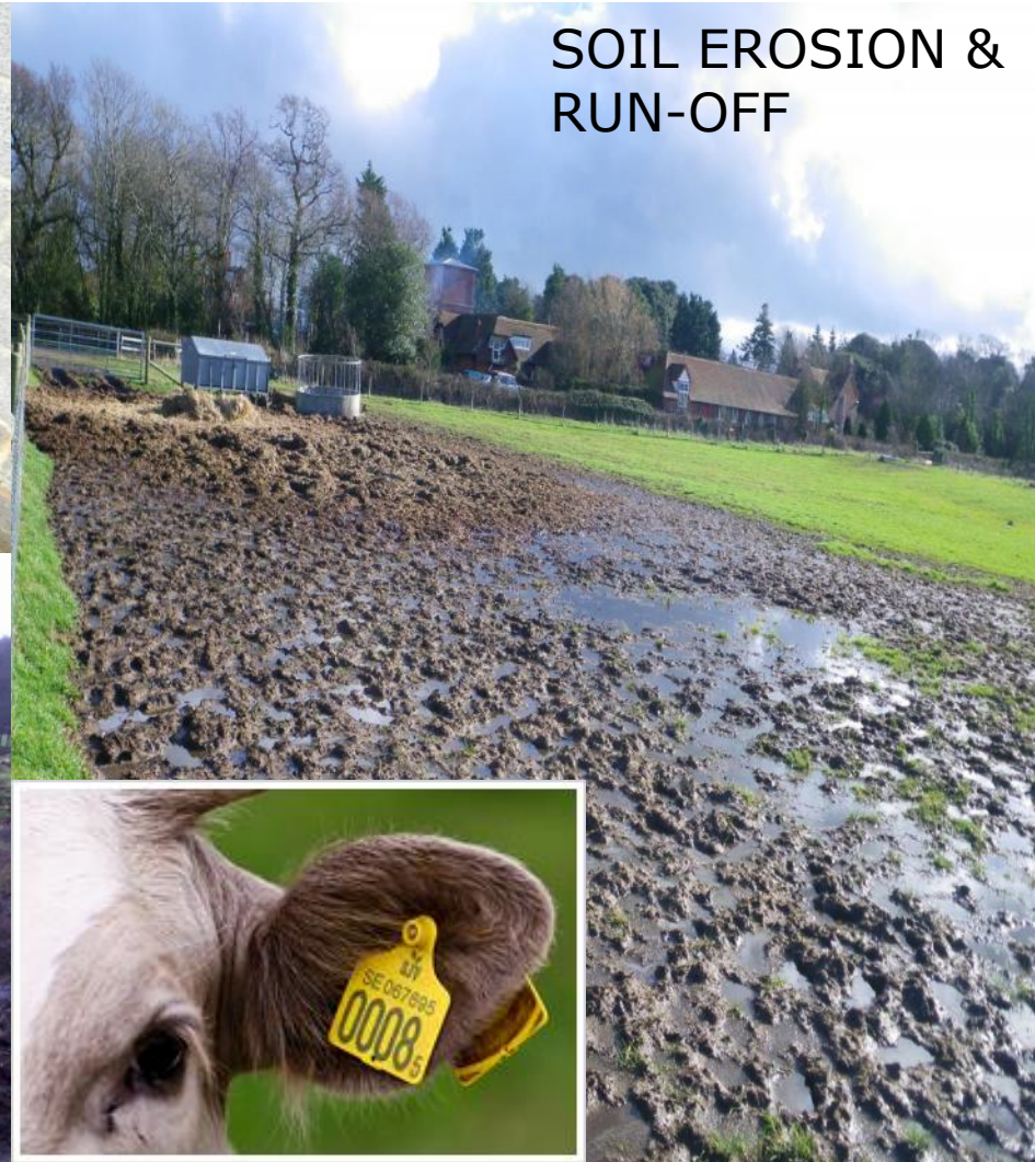
SOIL EROSION & RUN-OFF