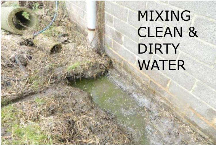
MIXING CLEAN & DIRTY WATER