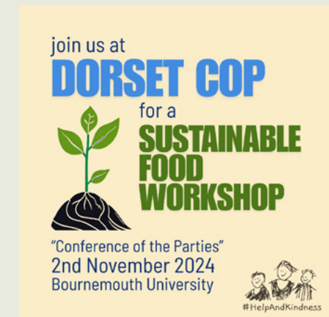
Dorset COP Promotion (Help & Kindness)

More information about Dorset COP can be found at: www.dorsetcop.info