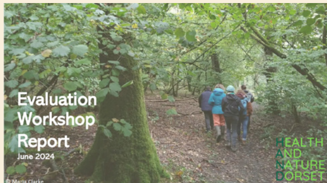
Report covers (HAND)