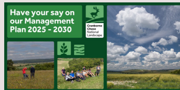
Cranborne Chase Management Plan promotion (Cranborne Chase National Landscape)