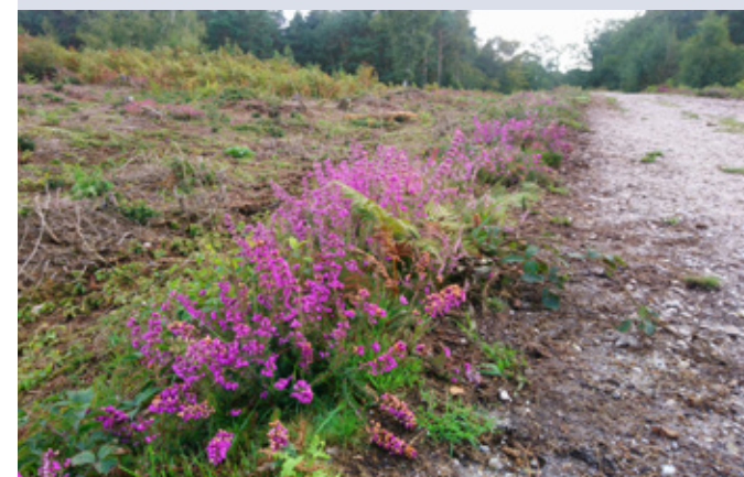
Above: Puddletown Forest