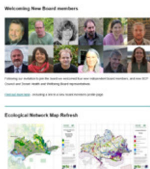
Above: LNP Newsletter