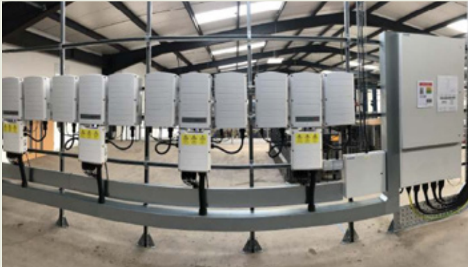
Above left and right: William Hughes Solar Photovoltaic System