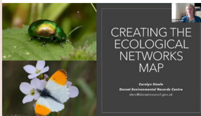
Above left and right: Dorset LNP Annual Forum