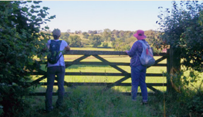
Above: Walk at Melbury Osmond