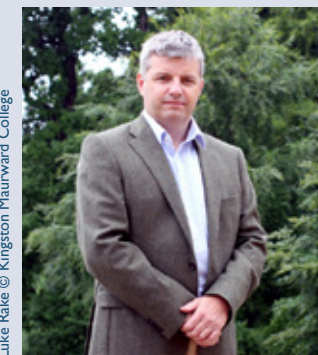
Luke Rake © Kingston Maurward College