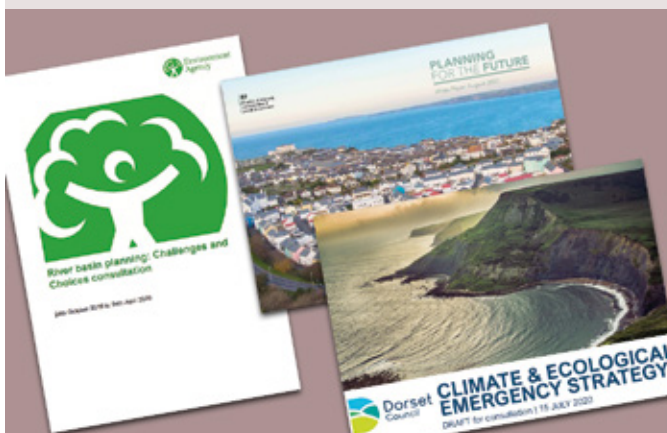
Above: Consultations documents