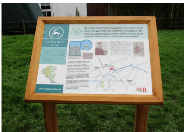
Information board along the route

Working with communities along the path aims to develop community ownership, awareness and understanding.