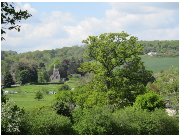
View from North Dorset Trailway near Stourpaine