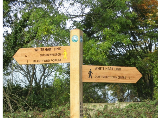
Finger post