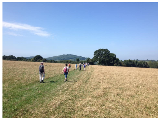
Walking between Sutton Waldron and Shaftesbury

Over the next few years there will be improvements to furniture along the route, improved signage and links to other routes, local facilities, and links to public transport (where possible).