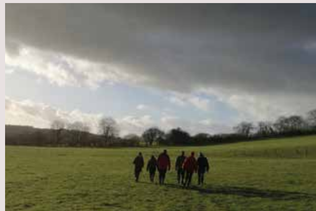
Above: Kingcombe health walk

As set out in the Natural Health section of this report, closer work with the health systems in Dorset has been undertaken. The work on Natural Choices and the SW LNP Health and Nature Project has led to Dorset LNP and Public Health Dorset signing a two-year Memorandum of Understanding funding agreement to continue the nature-based health work under the Healthy Places section of the Prevention at Scale programme.