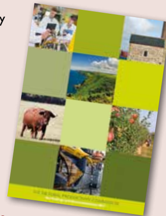
Above: SW Rural Productivity Commission Report

The SW Rural Productivity Commission Report is available at: https://bit.ly/2QidaY4