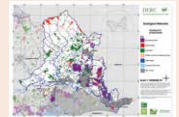
Above: Ecological Network Maps: Purbeck and Christchurch and East Dorset