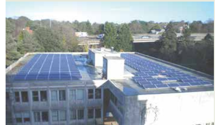
Above: Bournemouth Town Hall

The position papers are available at: www.dorsetlnp.org.uk/Dorset_LNP_Position_Papers