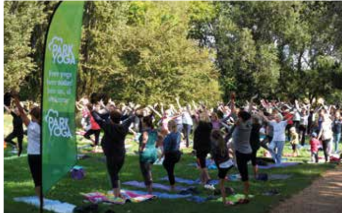
Above: Park Yoga, Weymouth

More information is available at: www.dorsetlnp.org.uk/Natural_Choices