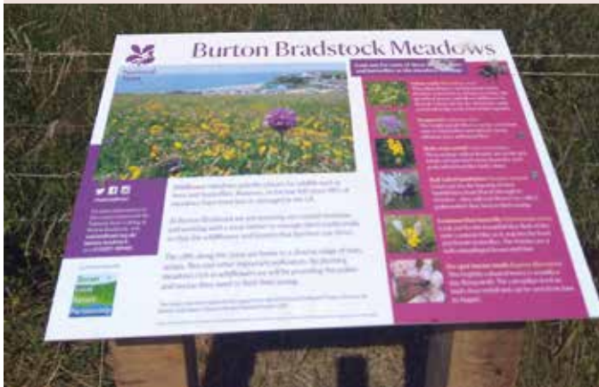
Above: Burton Bradstock Meadow - National Trust

More information on the project is available at: www.dorsetlnp.org.uk/local_pollinators