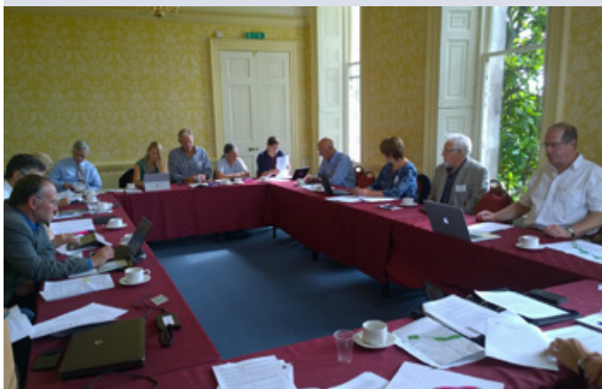
Above: Board meeting

During 2016-17 Dorset LNP was financially supported by Borough of Poole, Bournemouth Borough Council, Dorset County Council, Dorset Wildlife Trust, Natural England, Chapman Lily Planning and RSPB.