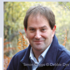
Simon Cripps