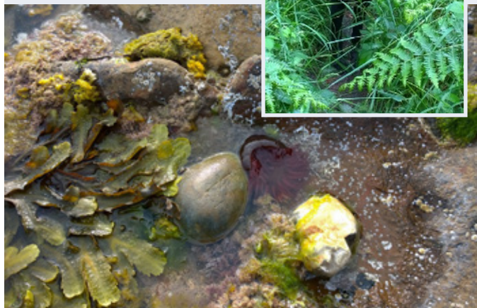
Above: Going wild