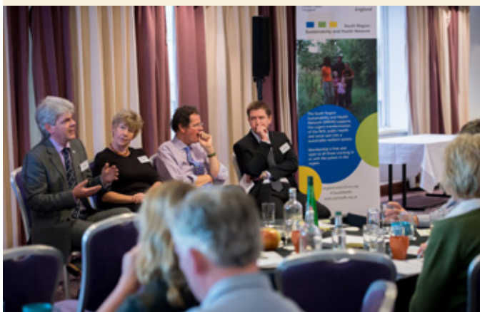
Above: Health conference

dorsetlnp.org.uk/health_and_nature_conference_Bristol_2016