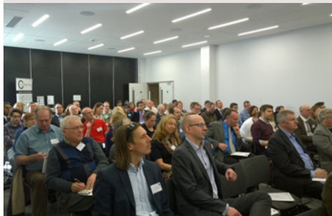
Above: Annual forum

dorsetlnp.org.uk/annual_forum_2017_presentations