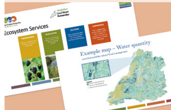
Above: Presentation slides on Ecosystem services

Dorset LNP has been working with LNP colleagues across the South West and the Dorset Catchments Partnerships to develop a proposal for the development of a suite of ecosystem service maps and opportunity maps. If the proposal is agreed maps will be developed during 2017-18.