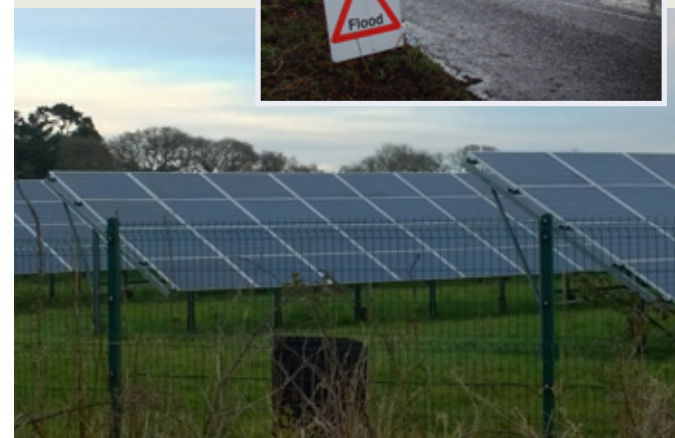
Above: Solar farm. Flooding.